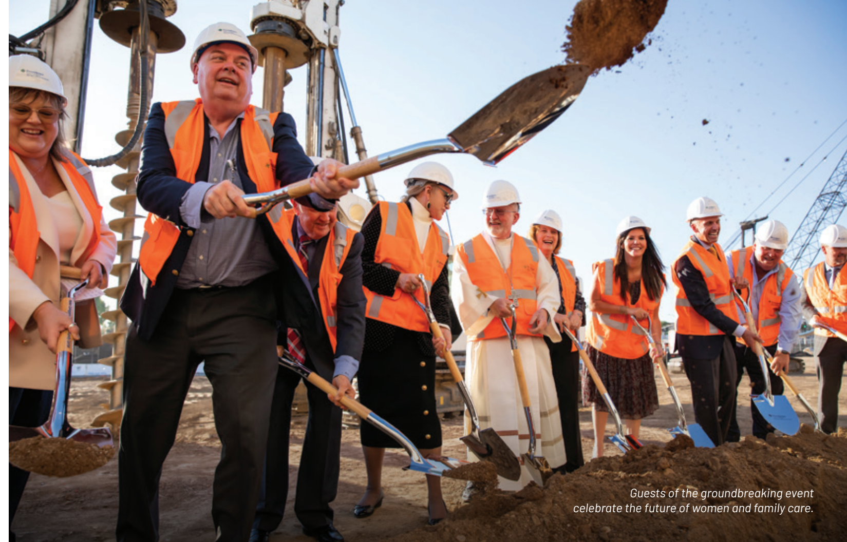
Guests of the groundbreaking event celebrate the future of women and family care.

"Philanthropy is the cornerstone for innovation. We appreciate the dedication of our hospital